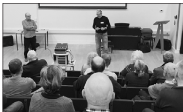
Using the Lecture Theatre