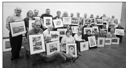
BCC Exhibition in the Michael Heseltine Gallery