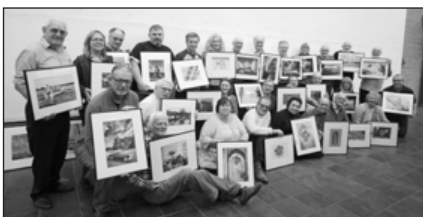
BCC Exhibition in the Michael Heseltine Gallery