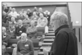
Using the Lecture Theatre

Visit us on the web at www.banburycameraclub.org.uk www.facebook.com/BanburyCameraClub